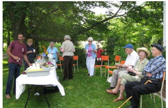
Annual July Community Garden Party (recognize Woodville High School Graduates)