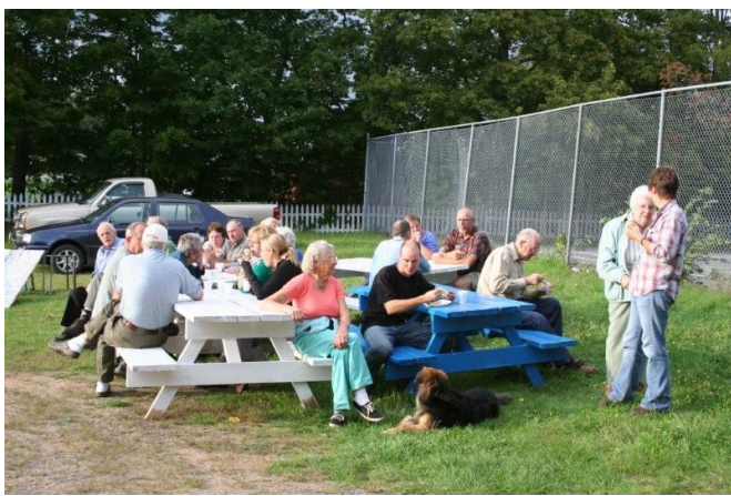
Woodville Community Corn Boil (held each year in August)