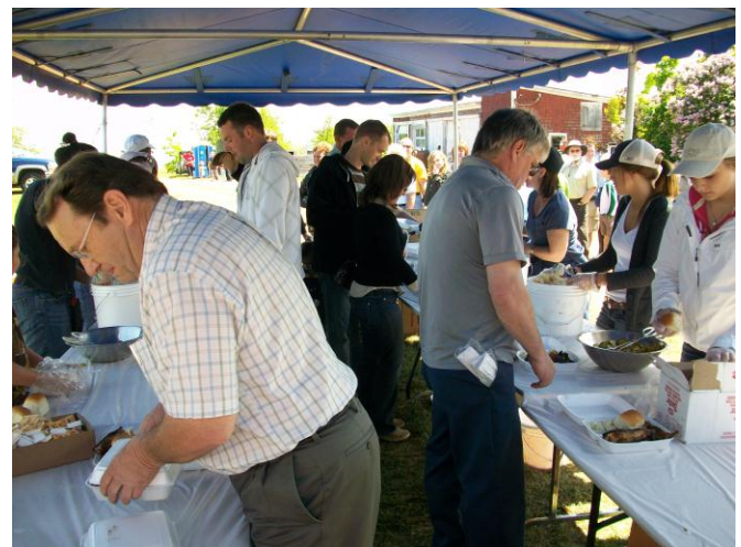
Woodville Chicken BBQ (40 th Annual being held on May 29, 2011. Serving 4000 ½ chicken dinners)

WOODVILLE Community Centre The Centre of your Community