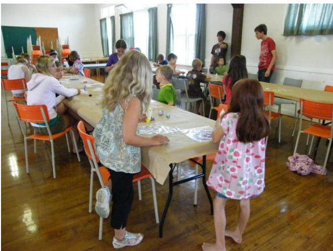
Woodville Day Camp (held first week in August)