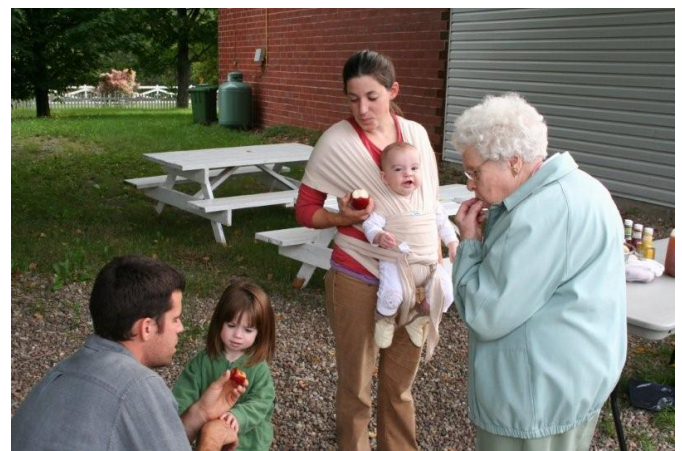
Woodville Community Corn Boil (fun and food for all ages)