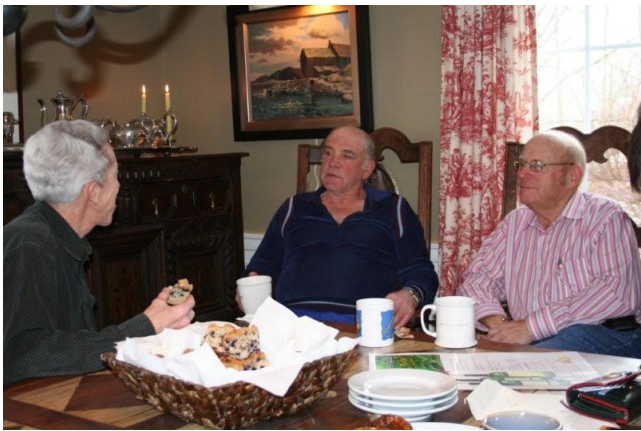
Coffee Parties (held weekly in Woodville homes Jan – Apr)