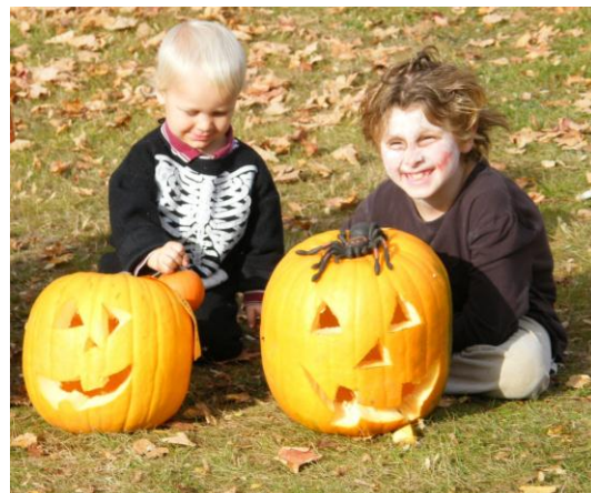
Pumpkin Carving Party (An Annual Tradition in Woodville)