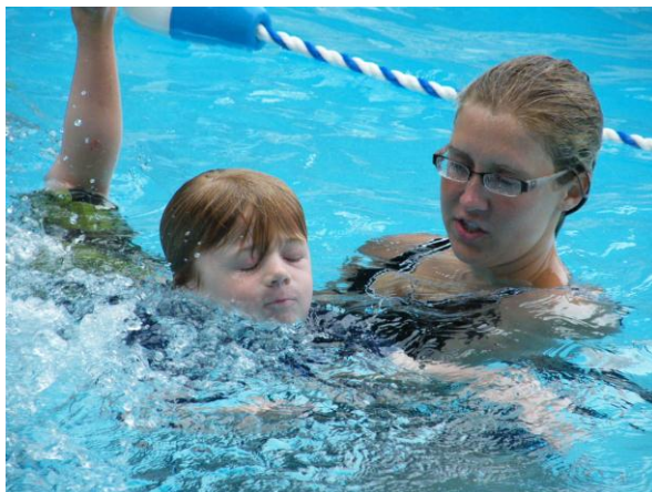
Woodville Youth Swimming Lessons (120 Participants in 2010)