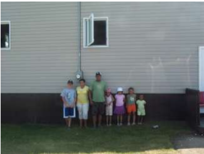
After – Official Opening