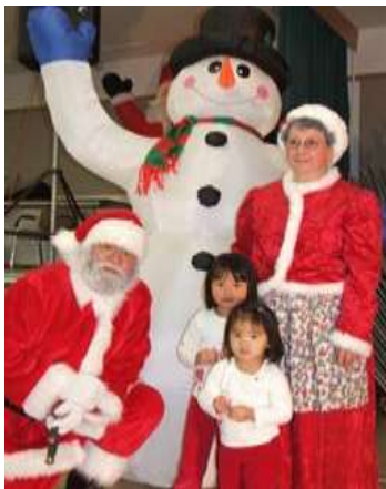
Festival of Trees

Let this be your invitation to St. Peter's – experience our spirit first-hand!