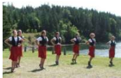
Acadian Dancers at Battery Park

Nicolas Denys Days Festival: The week-long annual Nicolas Denys Days Festival leads into the long weekend in August and has been a signature event in the Village of St. Peter's for more than 30 years. This festival is a full week long – a remarkable feat for a festival run 100% by volunteers. The 2009 Festival included 44 separate events that were held in the Village including a Sheep Shearing demonstration, Family Movie Night, Youth Ball Hockey Tournament, Sailing Tours, Deep Fried Turkey, Slow Pitch Tournament, the annual MacDonnell Cup sailing race, and many more. A new signature event at the festival this year was Art Al Frescoe - an event in which artists set up their easels all over the village of St. Peter's for a day of outdoor painting. It was also a wonderful experience for the public to observe artists at work and to have the chance to buy work they've been watching the artist create.