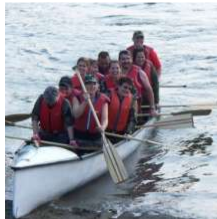
Nicolas Denys Days War Canoe Races