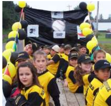
St. Peter's Cougars (Mosquitoe Team) ND Days 2008 Parade Float

Each activity/event in the Festival line-up is hosted by a community group or business, which is responsible for executing the event and also retains 100% of the funds raised by the event. In addition, VOCA has encouraged participating groups to recruit volunteers for specific activities rather than as “full-time” (or board-level members). To assist VOCA and other groups with this approach to volunteer recruitment, VOCA has started to systematically document “how to” guides for many activities and share this information with interested groups that defines required resources and even includes “Job Description” information.