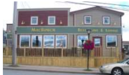
Newly Renovated Business Storefront

Facilitated by the Strait-Highlands Regional Development Agency, the planning process was intensively consultative, with community groups, businesses and residents participating actively. The formation of a new economic development group that includes representatives from 13 existing community organizations was a key component of the process.