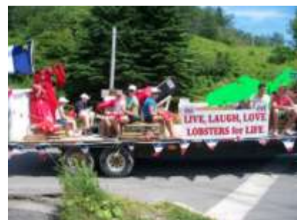
Lobsters R Us Float (local business)

Village on the Canal Association organizes this Festival every year and has adopted a philosophy of contribution to the community and activity-based volunteerism – in fact, with almost 1600 people attending, thousands of dollars were raised for local groups in