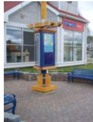
New Community Kiosk

This group, the St. Peter's Economic Development Organization (SPEDO), is working in partnership with the Strait-Highlands Regional Development Agency, to implement a commercial storefront and streetscape program that is seeing the Village embrace its history and ready itself for the future with renovations and infrastructure upgrades all along the main street and some adjacent areas. Businesses and residents have taken ownership of this new vision; St. Peter's is already sporting a brand new look with extensive streetscape improvements and business façade improvements (8 completed, 10 underway or in design stage).